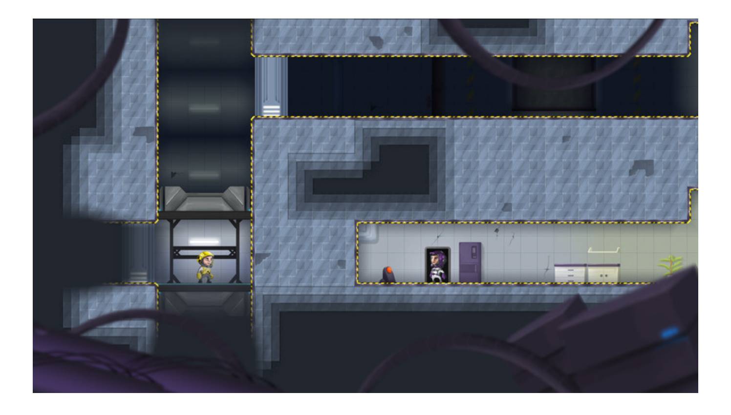
BLACKHOLE: Testing Laboratory Crack Unlock Code And Serial

Download ->->-> <a href="http://bit.ly/2JoAp1z">http://bit.ly/2JoAp1z</a>