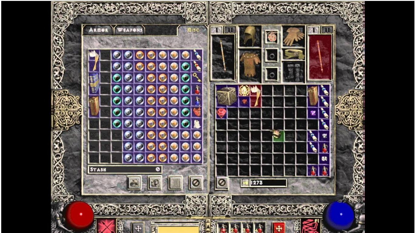
Diablo II Item Pack